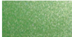
Granny Smith Green